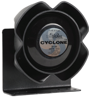
D-44 with SPBRK-16